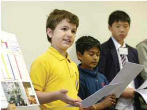
Images, above top: A Sorrell Foundation workshop at the Victoria & Albert Museum.