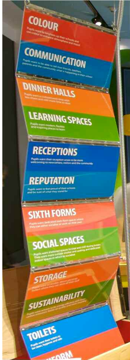
Images, above and main picture: The Sorrell Foundation Young Design Centre at Somerset House