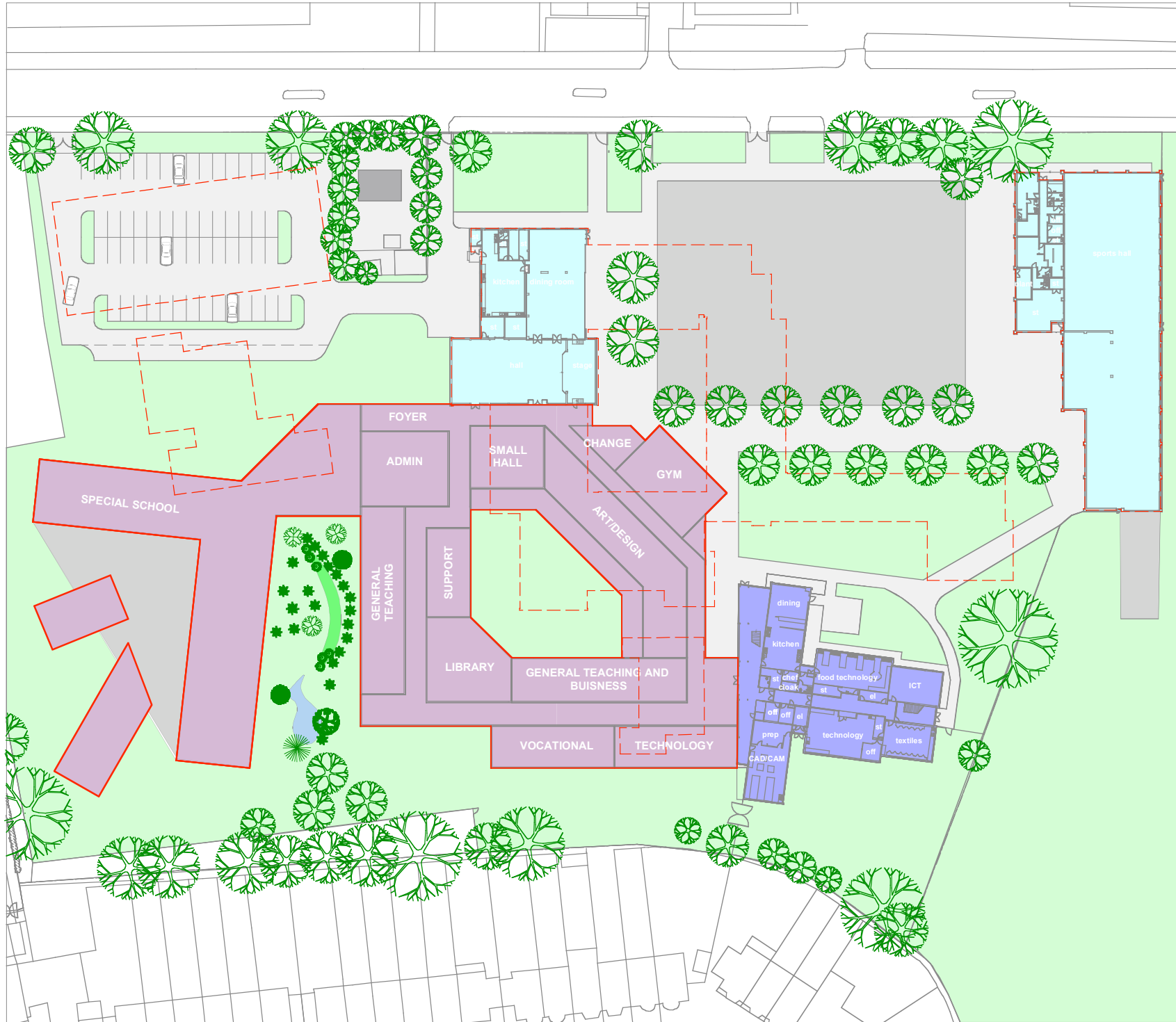
Proposed Ground Floor Plan (option A)